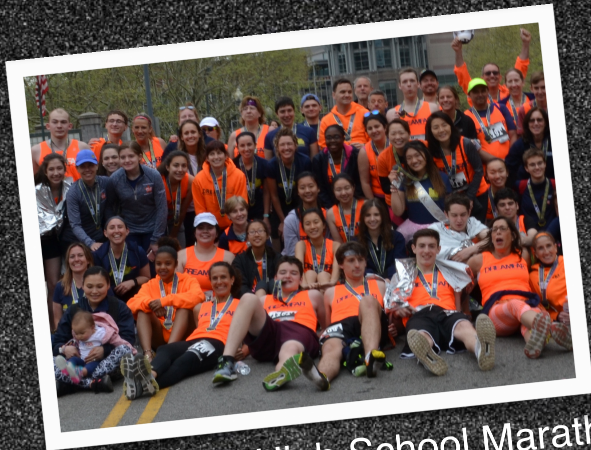
Dream Far High School Marathon Board of Directors

I volunteer for organizations that help people achieve beyond their perceived potential.