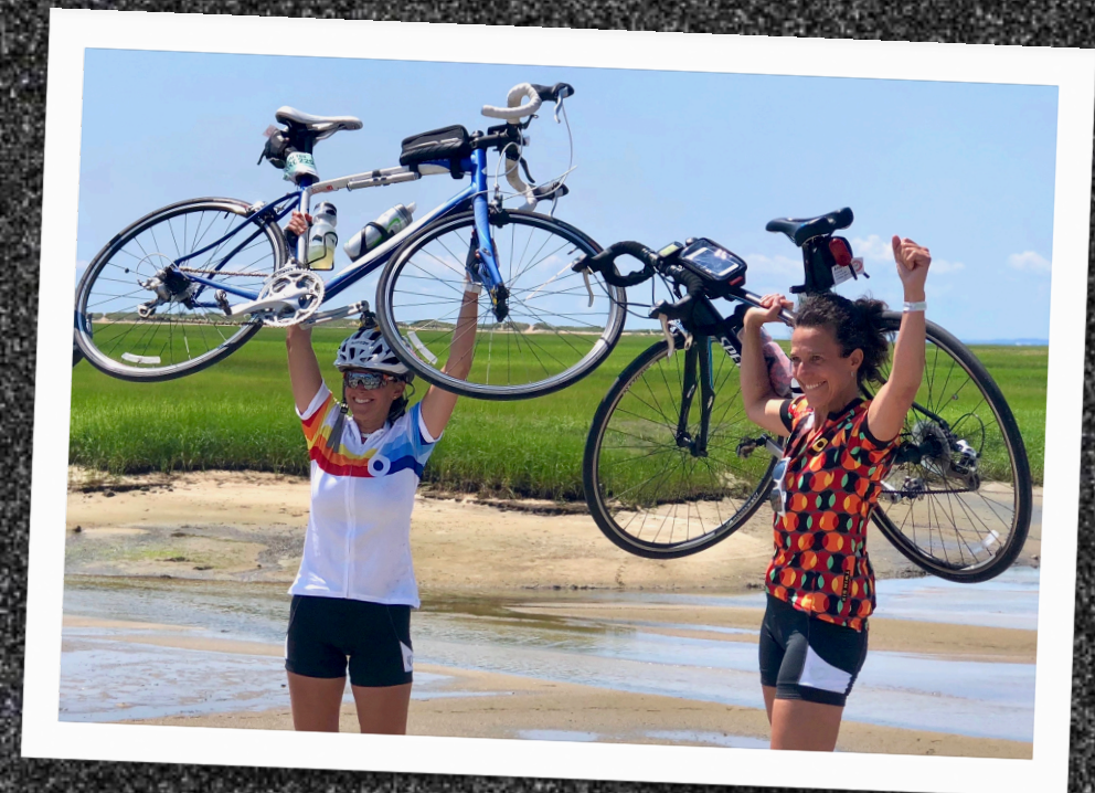
Pan-Mass Challenge Rider