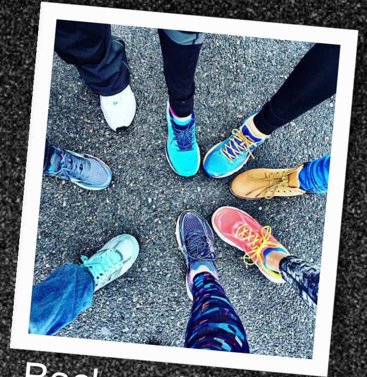
Back on My Feet Advisory Board